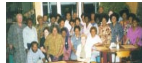
Part of the group of 43 students undertaking Nurse Conversion Degree course, PNG

Financial Management - Tanorama manages project trust accounts and in-country spending for different projects and organisations.