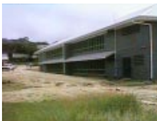
Nurses dormitory at UPNG Taurama campus

Project Management - Tanorama is experienced in providing project management services on behalf of its clients. We have a proven track record in the successful management and completion of projects on time and under budget.