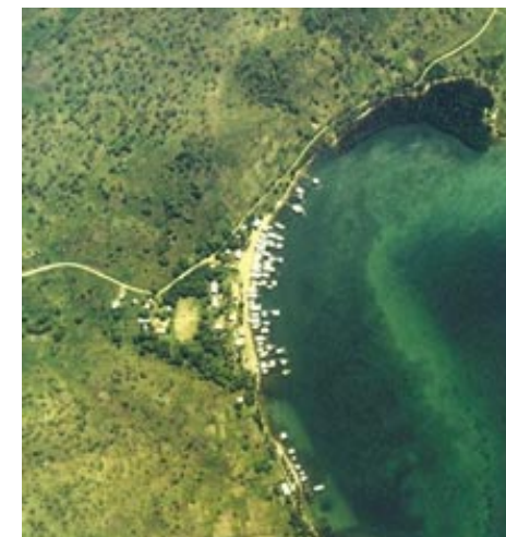
Coastal village, Central Province, Papua New Guinea